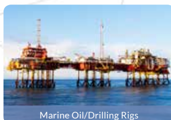
Marine Oil/Drilling Rigs