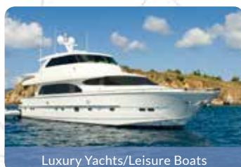
Luxury Yachts/Leisure Boats